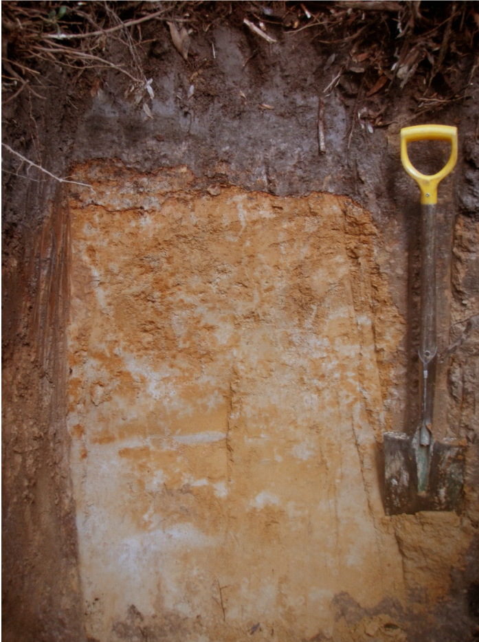
Figure 3. The Podzol profile at the dated dune site.

In scenario (b) the Huon River was already flowing at a level close to its present floodplain c. 40 ka ago and the bouldery terrace at a higher level had a cover of grasses and possibly shrubs, possibly because of extremely dry conditions or because the terrace was a frost flat. During droughts and westerly winds sands blew off the floodplain onto the adjacent terrace.