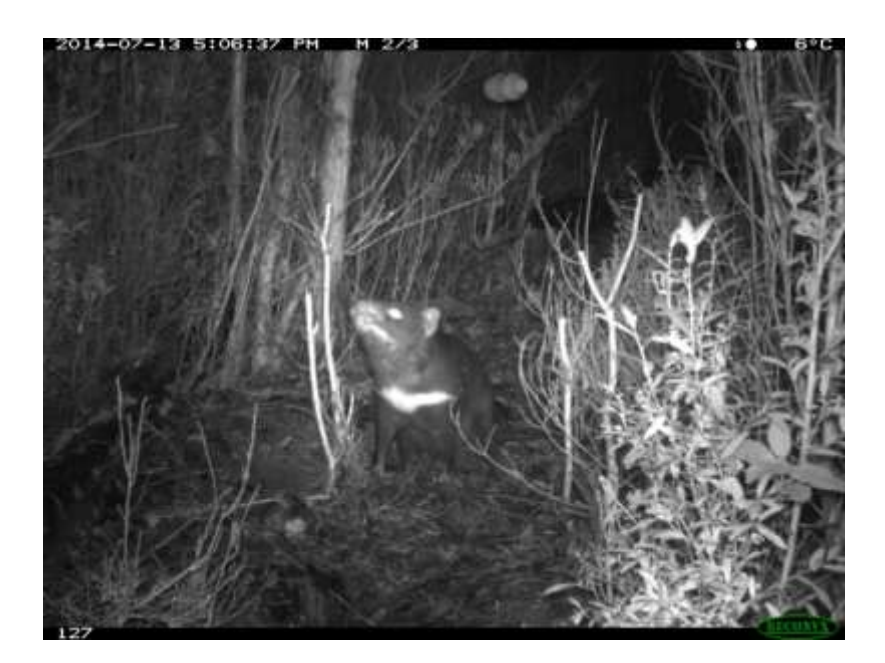
Figure 5. Tasmanian devil female heavy with pouch young from regenerating native forest behind Loyetea (J Lyall)