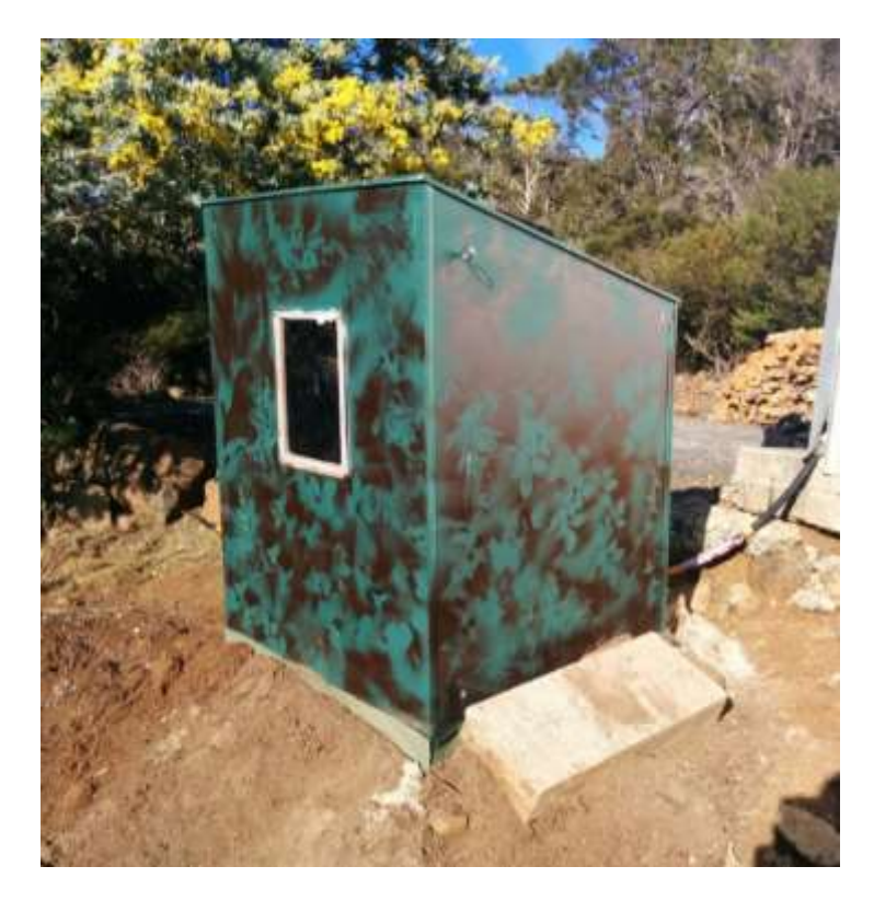
Figure 4. An example of the box housing a telescope used to monitor nesting behaviour of eagles.